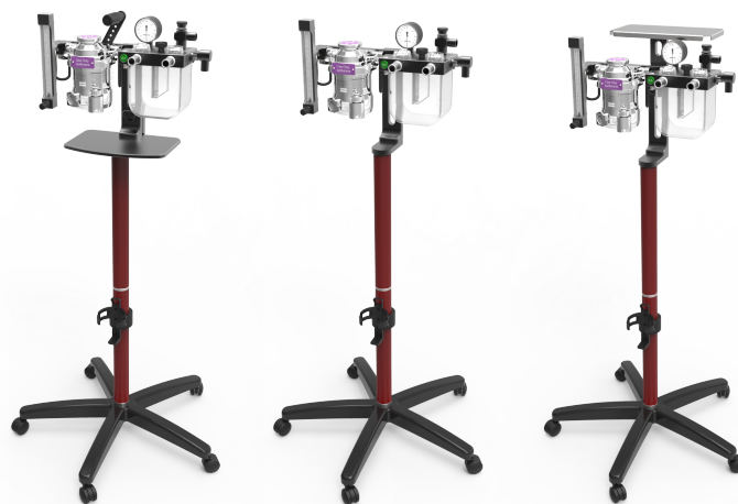
VAM-510QS* Quick Stand Mount